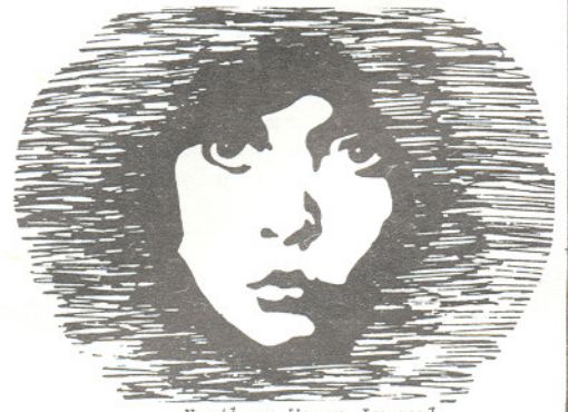
Northern Woman Journal