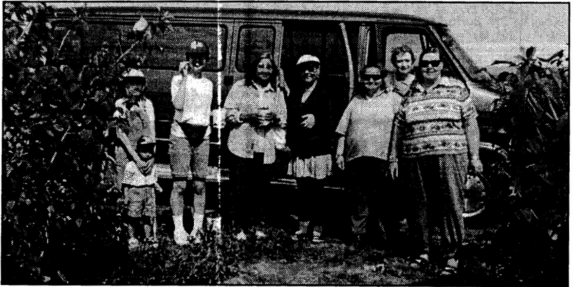
Women picked 24lbs of raspberries out in Richmond. The raspberries were donated to the feast marking the end to the Elder's Fast.