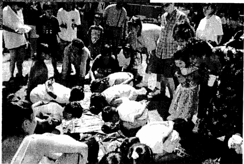
Watermelon Eating Contest!