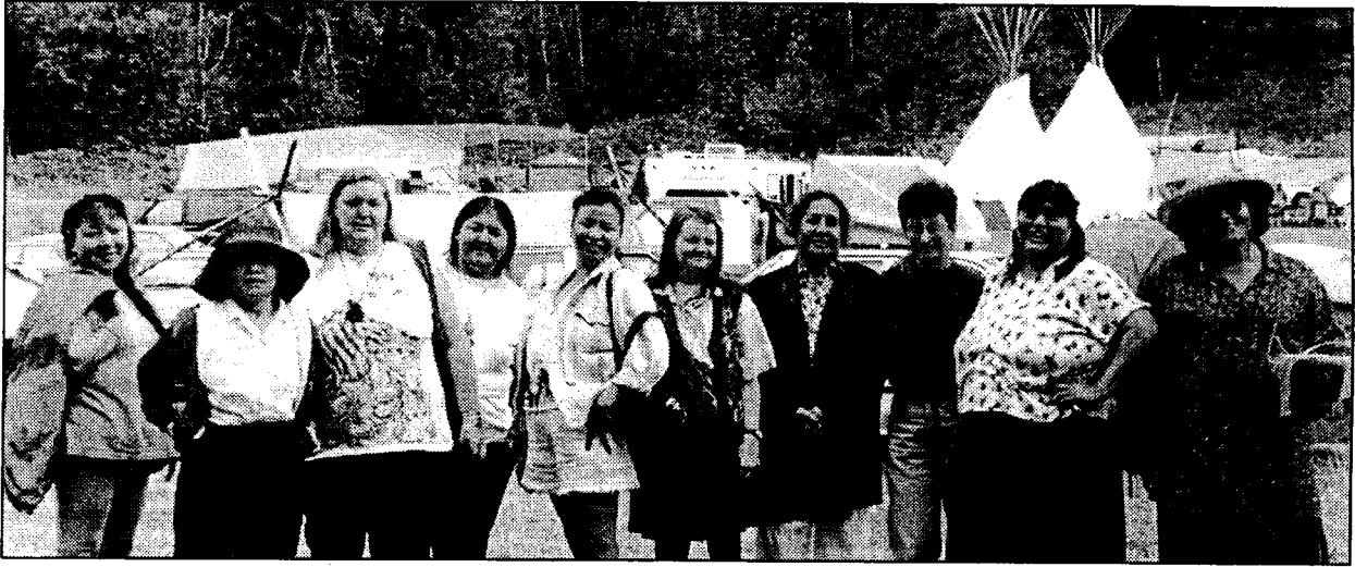
Members of the Learning Group at the Medicine Wheel Gathering in August.

I'm a woman a granddaughter a sister a niece a friend