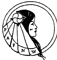
Pacific Association of First Nations Women