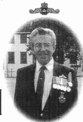
"Until we meet again"

He is remembered for his smile, humour, generosity, and class. His hobby was cooking, and his recipes were in much demand.