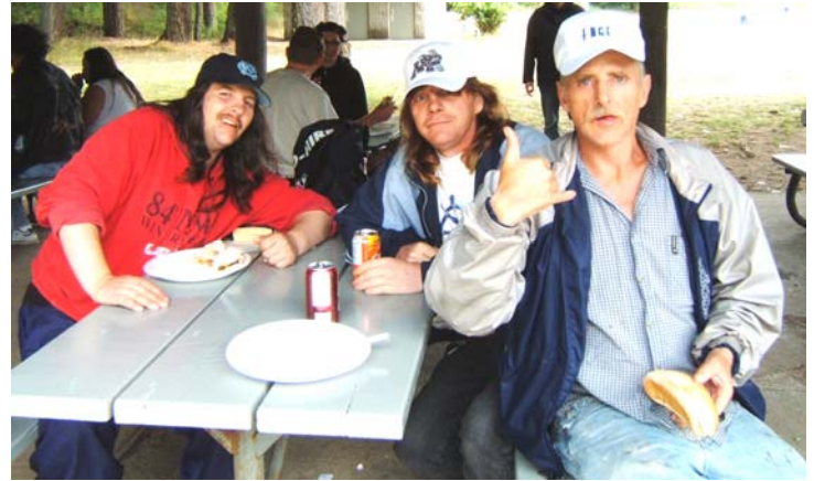
PWP members enjoying the food and nice weather at the summer BBQ.

The Positive Wellness Program (PWP) welcomed in the summer with our second annual BBQ at Beaver Lake Park. About 20 PWP members (and their canine companions!) joined staff and volunteers for a picnic with tasty BBQ. Staff and program members alike always look forward to getting out of the city and enjoying the some fresh air and good company at the park. Special thanks go to Tammy from the Boys and Girls Club of Victoria for providing us with safe bus transportation to and from Beaver Lake.