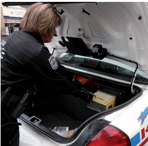
VICTORIA POLICE VEHICLES ARE EQUIPPED WITH SHARPS CONTAINERS.

To have someone come and pick up needles on private property, please call the VARCS Mobile X at 250-888-4487 (weekdays), SOLID's syringe recovery team at 250-298-9197 (mornings, 7 days/week), or AIDS Vancouver Island (weekdays) 250-384-2366.