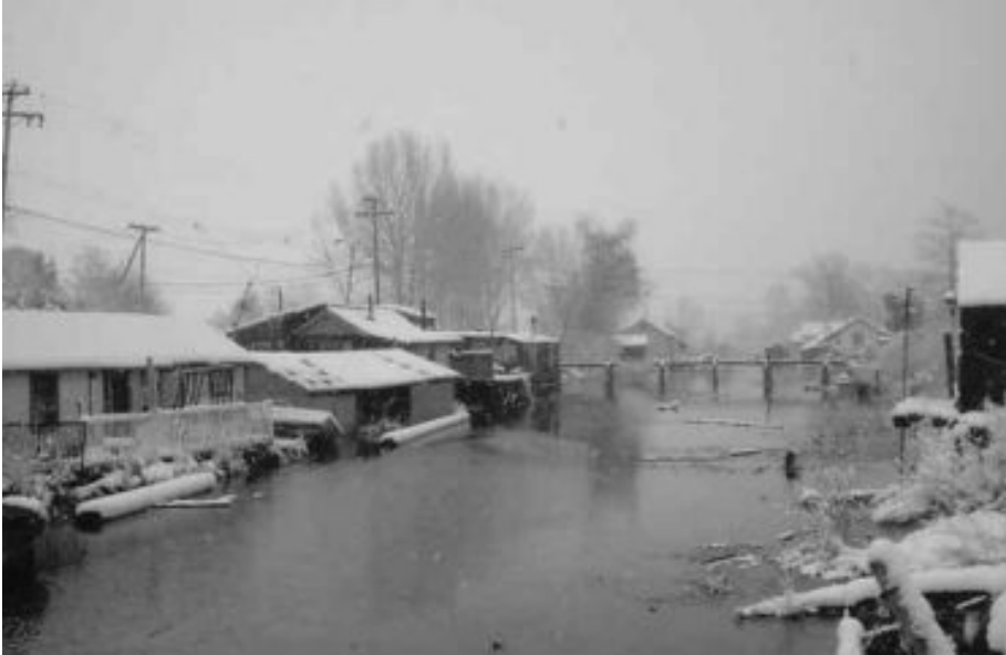
Immigrants from Finland built 70 homes on stilts in a tidal area in the early 1890s. About 50 residents continue to live at the Finn Slough to this day.

We are the squatters on Abbott Street. You might as well give up. Cuz we won't be beat! We know this street up and down. Help us make Woodward's our home right now! The cops are walking down the street. In the shadows some of us get beat. You brush us off like we're stupid and soft. But we're smart and strong and we will GO ON! Until Woodward's is ours Rock on guys and to us ALL THE POWER