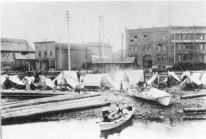
Natives camping along Burrard Inlet. Date unknown.