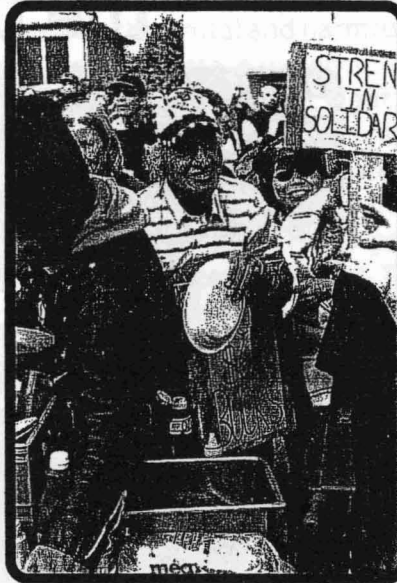
Supporters at APC's Picnic at the Premier's on April 1st, 2002.