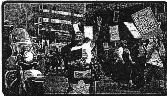
August 2002 at the Welfare on Demand demo.

(see the back page) and to building a diverse and participatory movement of poor and working people, women, people of colour, First Nations, queers, immigrants, refugees, disabled, elders, youth, and all struggling for freedom and justice.