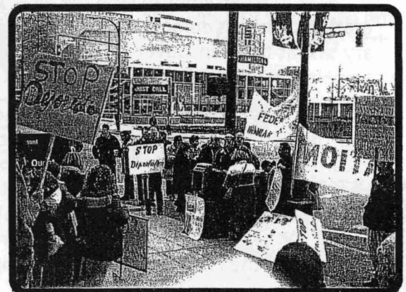
Demo against deportations to Iran on Dec 9/02.

Those of us who fight against this war of terror and struggle for human rights must stand together against deportation, detentions and the imperialism of the Immigration Act. When communities are under attack by the government we must assist in defending them. APC believes direct action cannot be confined in general themes but in order to be effective must become a weapon of self defence in the day-to-day lives of those organizing to fight back.