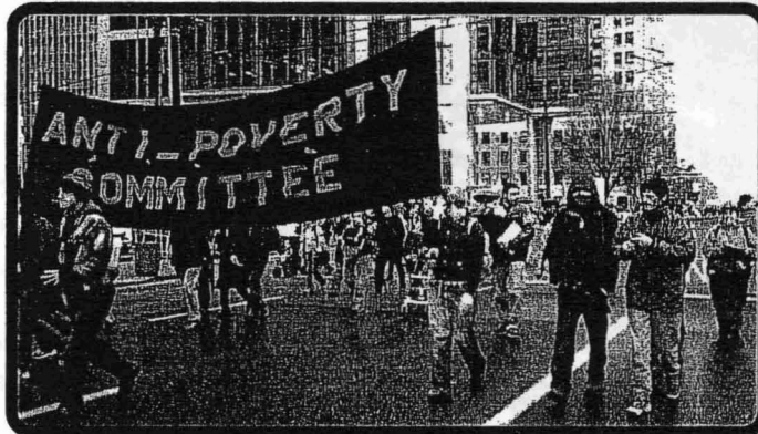
APC at the November 17th, 2002 rally against the War in Iraq

that so many have fled America in hopes of sanctuary in Canada. From January to October of this past year, 191 people filled refugee claims citing persecution in the US. The number has risen considerably since, mostly along the BC border.