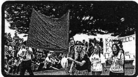
APC and QUAK at PRIDE, August 4/02