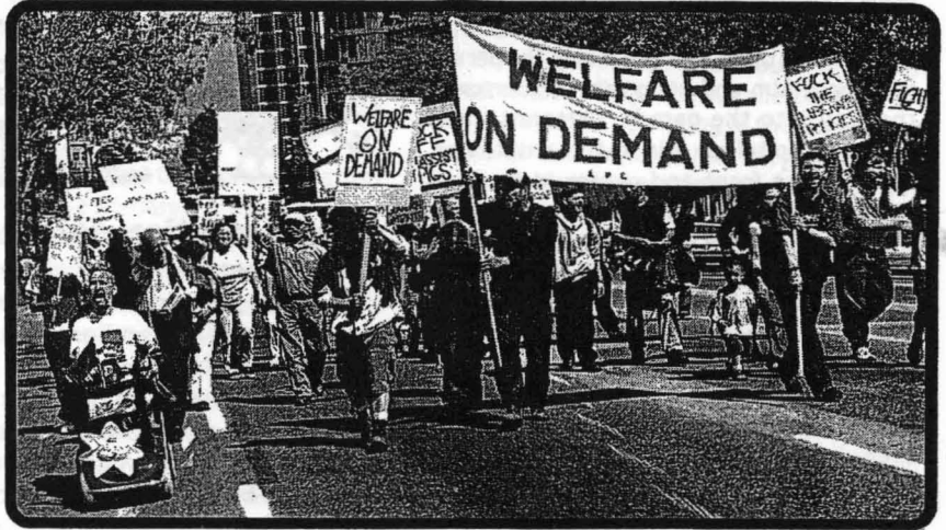
The march to the Regional Executive Welfare Office

The demonstration was confident and militant far beyond its numbers. We took the street without pause and did not hesitate at the police blocking the doors. As we beat the doors behind them and stickered the windows with our demands, two women dropped a banner reading "DEFEAT THIS GOVERNMENT!" from the balcony above the crowd. When a security guard tried to pull the banner up, a group of people on the ground rushed forward and held the banner. Eight people broke into the building through a back door and stormed into the lobby behind the line of shaken cops, waving banners and chanting, "FIGHT FIGHT FIGHT, WELFARE IS A RIGHT!" They pushed the front door open against the police and two were dragged out in chokeholds and arm locks. The others stayed inside and the glass barriers were pounded on from both sides.